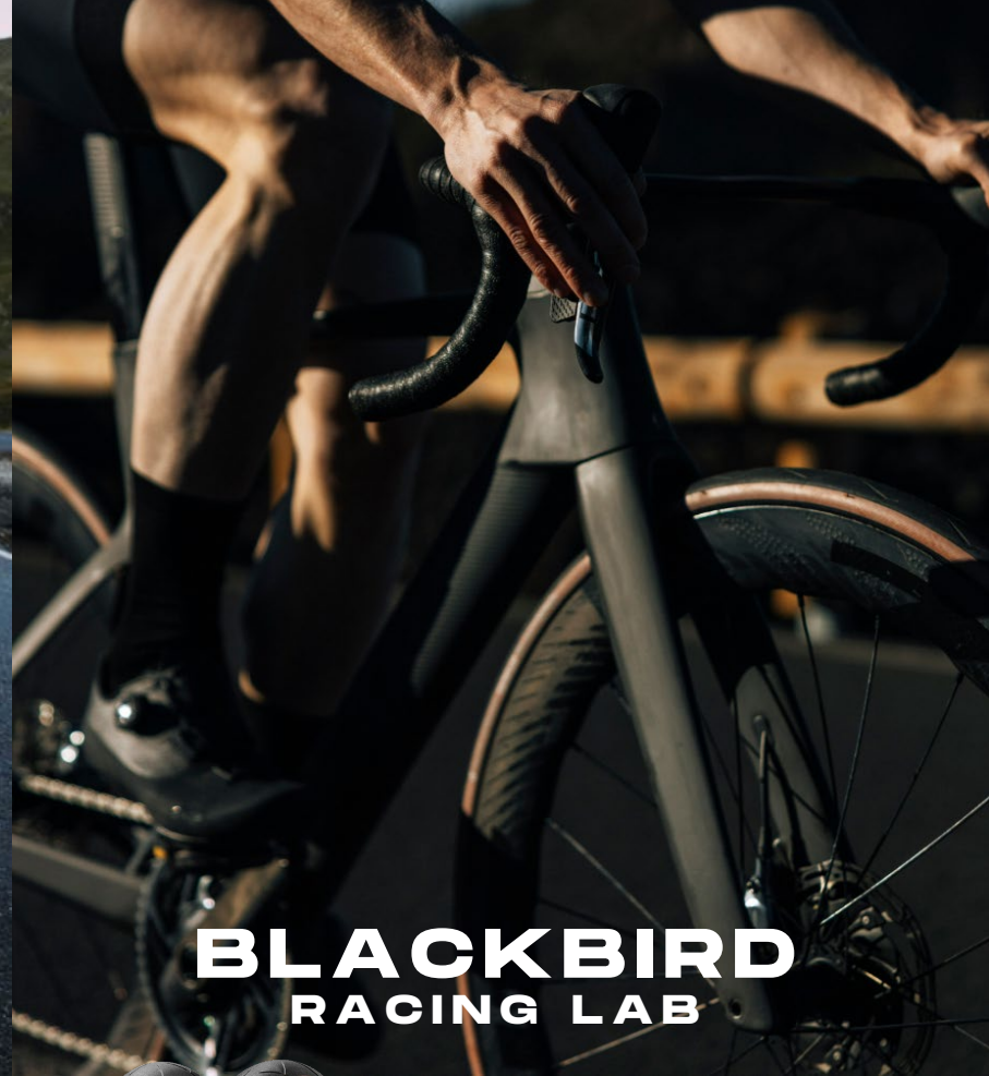
BLACKBIRD RACING LAB